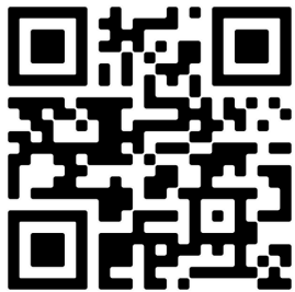
SACCounty Healthy Beginnings