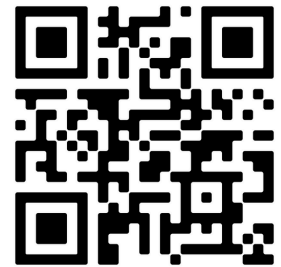
Safer Sacramento Youth

Sacramento County Substance Use Prevention and Treatment (SUPT) is thrilled to share three groundbreaking projects designed to inspire , connect , and create change in Sacramento County. Discover the possibilities, help educate the community, and take action.